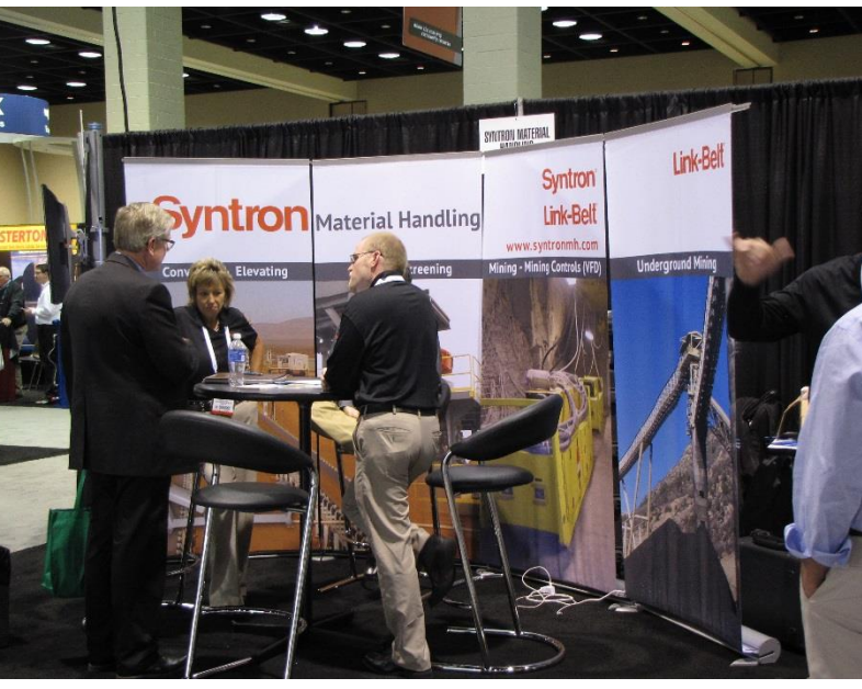
Syntron Material Handling